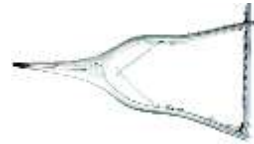
Spreader Forceps for Small Anatomy