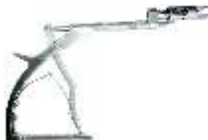
Persuader for Small Anatomy