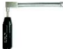
Rod Stabilizer for Small Anatomy