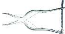
Compressing Forceps for Small Anatomy