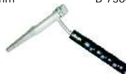
Stop Guide for Small Anatomy

Dia Part No. 3.5 mm B 734001000 4.3 mm B 735001000 5.0 mm B 736001000